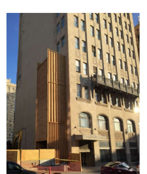
Power & Light Building Apartments Kansas City, MO

Each month during construction, Lacy & Company prepares a thorough written report to the bank describing our findings and listing any discrepancies that should be resolved prior to the release of funds. Our reports are completed in a timely and professional manner, and our services are cost efficient.