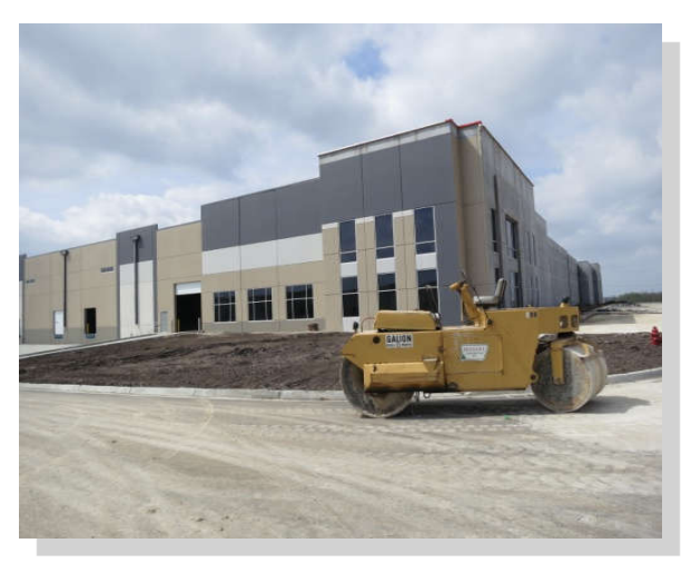
Logistics Park KC - Edgerton, KS